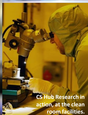
CS Hub Research in action, at the clean room facilities.